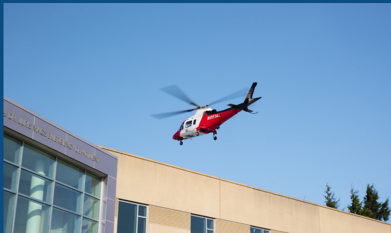
Level 3 Trauma Center